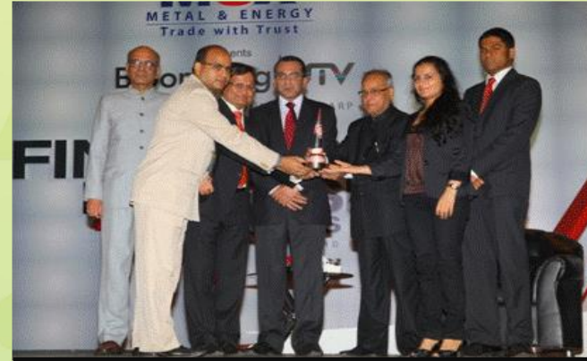
'Best Emerging Commodities Broker of India' (2011)