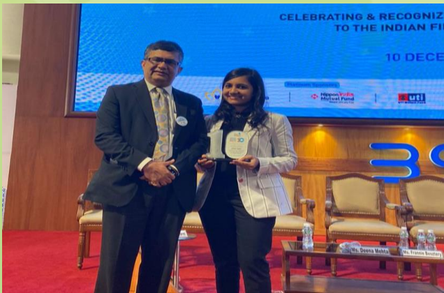
Awarded as a Star Performer in Mutual Funds by BSE (2019)