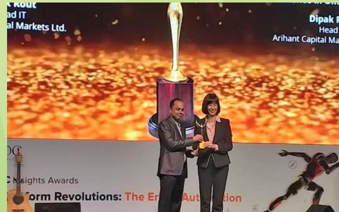
Recipient of Excellence in Omni Presence Technology by IDC Asia Pacific (2018,19)