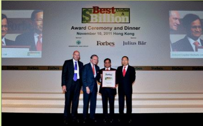
Forbes 'Best Under a Billion Company' in Asia-Pacific Region (2011)