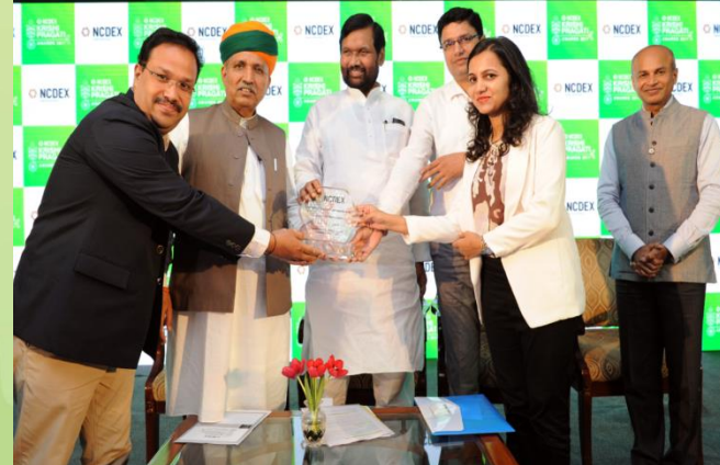
NCDEX 'Outstanding Leadership Award' at Krishi Pragati Awards, (2017 )