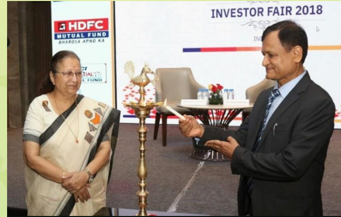
Our Chairman with Ms Sumitra Mahajan, Former Member of Parliament (2018)