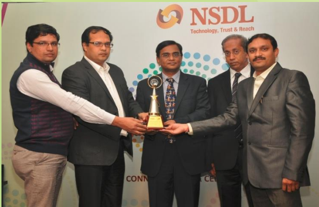
NSDL 'Top Performer in Active Accounts' (2013)